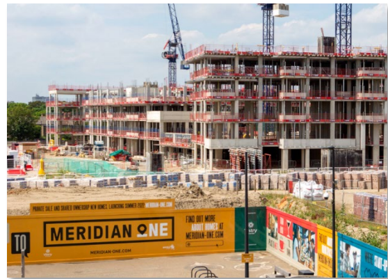
Meridian One Topping-out ceremony, October 2022